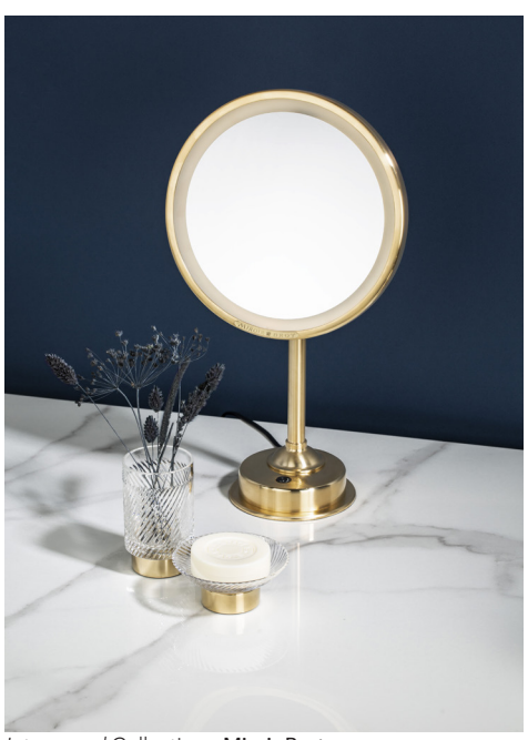
Intemporel Collection - Miroir Brot