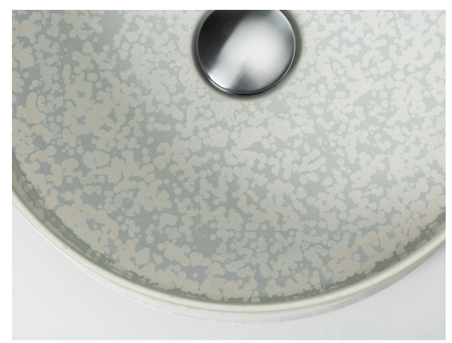
Serdaneli x Jaune de Chrome basin

Several of its flagship models are based on the aesthetic codes of yachting, such as the Naja and Profile collections.