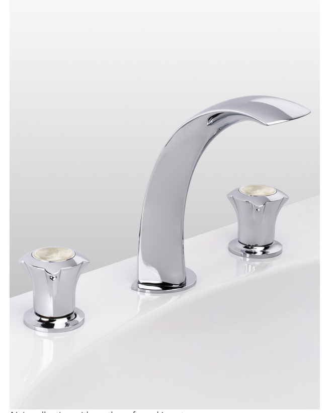
Naja collection with mother of pearl insert