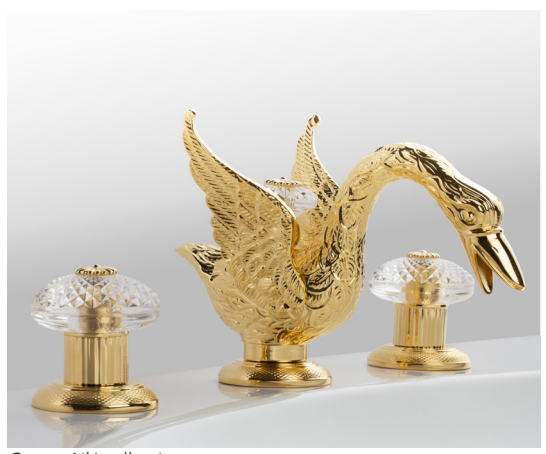
Cygne Ailé collection