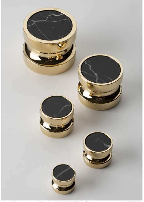
Néo knobs in Black Portoro marble