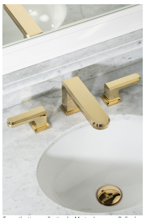
Transatlantique collection by Martyn Lawrence Bullard