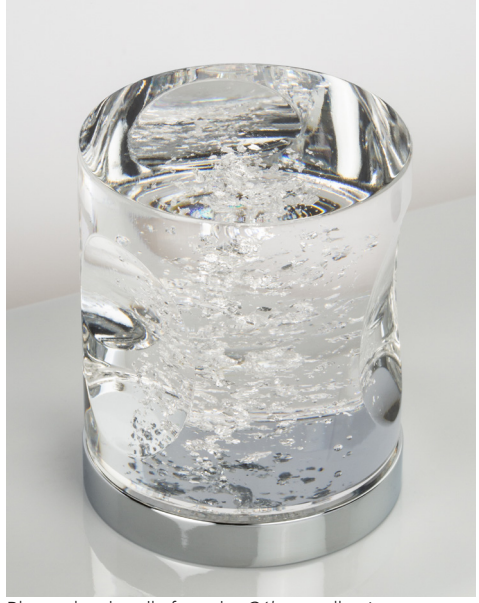
Blown glass handle from the Céleste collection