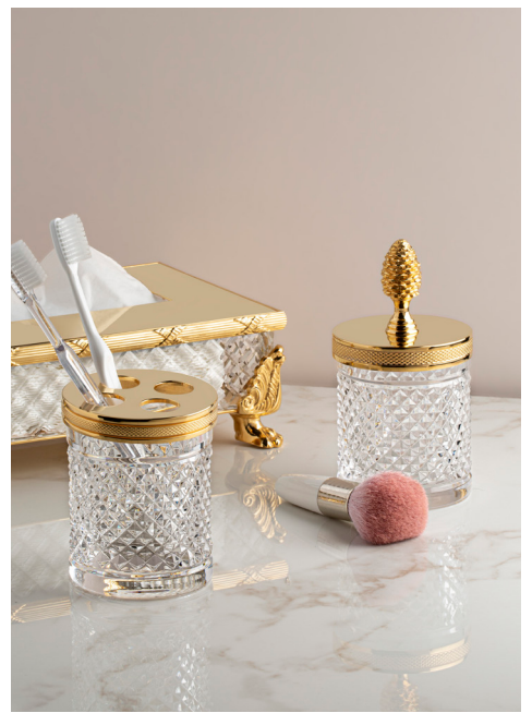
Diamant Collection - Cristal&Bronze

A key figure in the world of luxury bathrooms, the Maîtres Robinetiers de France cater to professionals (interior designers, decorators, etc.) as well as to private individuals in the hotel, retail, residential and yachting industries.