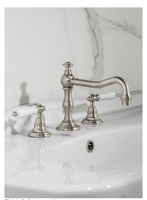
Thétis Collection - Margot